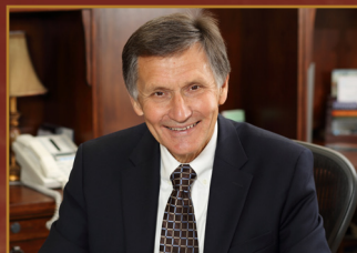
Reach Beyond President