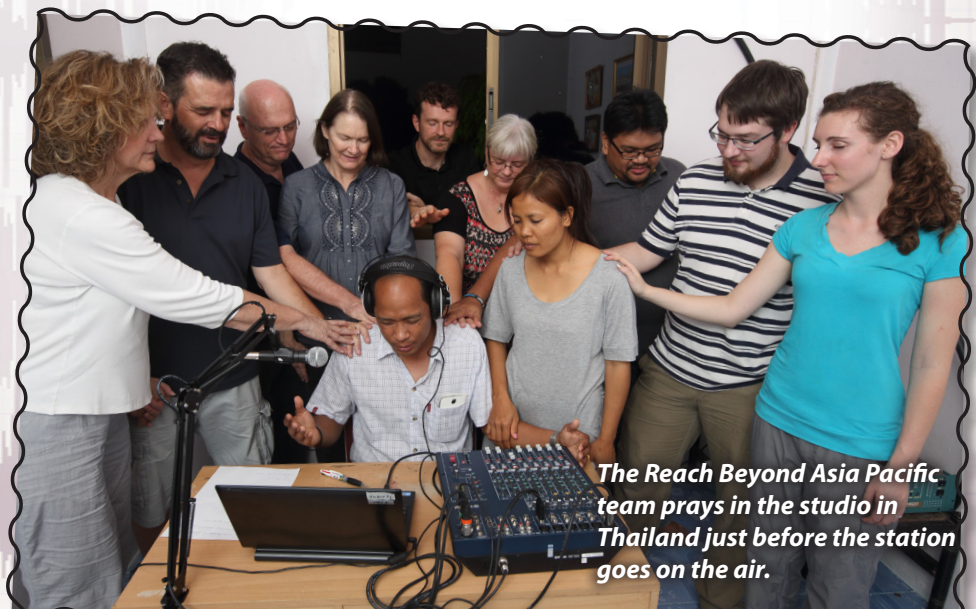
The Reach Beyond Asia Pacific team prays in the studio in Thailand just before the station goes on the air.

Our friends in Nepal have a vision to start 25 to 30 stations nationwide that will work with in partnership with us. This is a God-sized vision, for sure. It is indeed an encouraging development and shows God's favor toward the work. Praise Him!