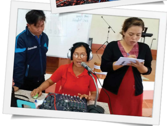
Top and Bottom: In Asia Pacific, Reach Beyond has helped to plant over 100 radio stations. Media training continues today to support the ongoing broadcast efforts.

“We walk alongside them for the long haul.”