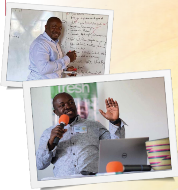
Top and Bottom: Reach Beyond continues to walk alongside our media partners in Africa, providing training, technical support and discipleship.

It is the same situation in much of the unreached world, especially in the 10/40 window.